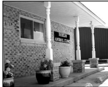
Shields Animal Clinic