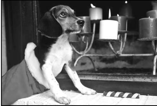
Maxwell adopted by the Johnson family in OK!

$10 for a box of 10! plus shipping if needed ($3 first box $1 each extra) Mail order to: RSR/OKBR Holiday Cards PO Box 98 Newcastle, OK 73065 Or online at www.rockyspot.com