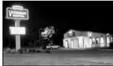
Neel Veterinary Hospital

Shields Animal Clinic is conveniently located on Shields Boulevard in Moore, Oklahoma and is open M/T/W/F 8am - 6pm & Thurs. 8am - Noon, and accepts same-day appointments (based on availability).