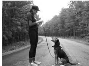
Daria since 2005

CONGRATULATIONS TO 5 OF RSR/OKBR LONG TIME RESIDENTS who have finally found their forever homes this quarter. It has been a long time coming ( for Daria and Lacy this is their second adoption chance) but we never gave up on these wonderful dogs! THANK YOU to the awesome families who saw the light shining in them!