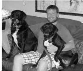
Lacy since 2006